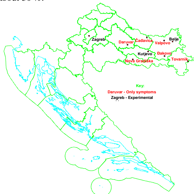
Fig. 1: Distribution map of the symptoms of BYDV in Croatia in 2002.

Barley yellow dwarf virus was first described in 1951 in California (Oswald and Houston 1951). Today it has spread to many cereal-growing areas, including the surroundings states of Croatia. In Croatia the symptoms had been described earlier leading to the presumption that this was BYDV (Panjan 1964; Šarić 1986) but BYDV was not experimentally proven. In the spring of 2002 marked stagnation in height of barley and yellowing leaves were observed in eastern Croatia (Darda, Brestovac, Belje). The same symptoms were observed on barley at other locations in Croatia (Kutjevo, Nova Gradiška, Daruvar, Tovarnik, Čađavica, Valpovo, Zagreb and Đakovo) and on winter wheat in Zagreb and Belje (Fig. 1). Based on the symptoms we presumed this was due to a virus infection. In infected areas the barley yield fell by about 30 %.