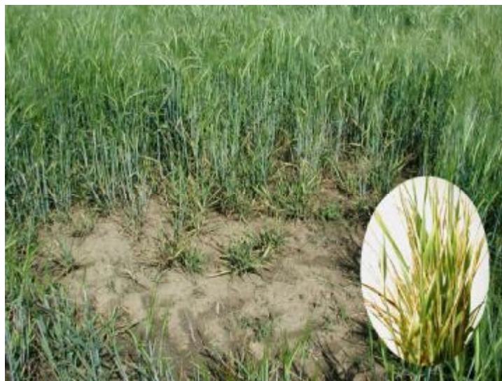
Fig. 2: Symptoms of BYDV on barley.